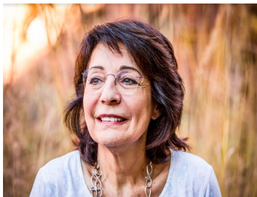
M aria Damanaki

Acting as an independent consultant in global organisations, Maria Damanaki is serving as an advisor for Oceans5 (USA), the Paradise Foundation (China) and Rockefeller Brothers Foundation (USA).